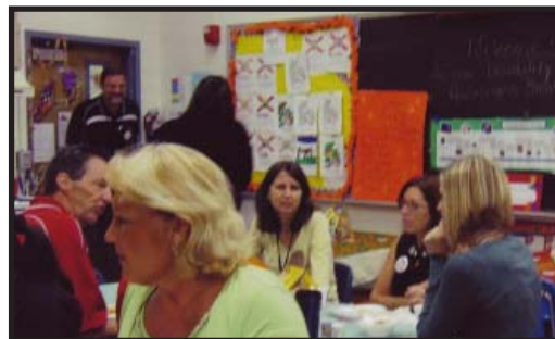
Guests enjoyed every bite!