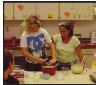
A student in Ms. Reed's class prepares food for the breakfast feast.